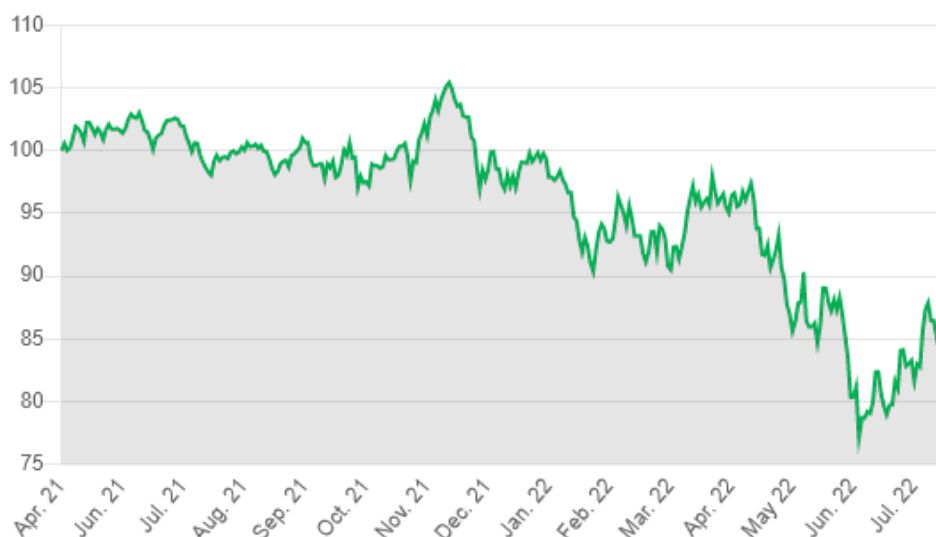
Monthly performance of the certificate net of fees (%):