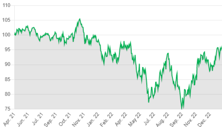
Monthly performance of the certificate net of fees (%):