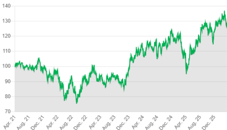
Monthly performance of the certificate net of fees (%):