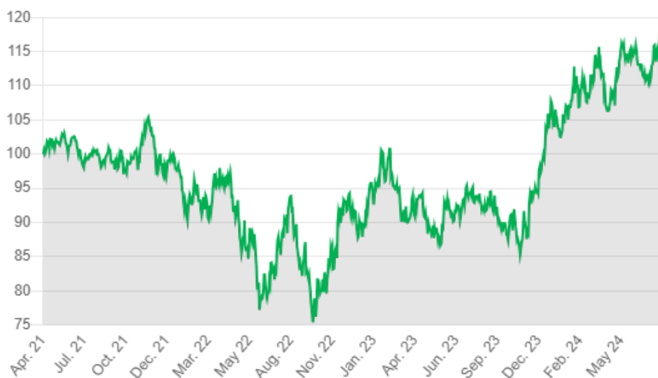
Monthly performance of the certificate net of fees (%):